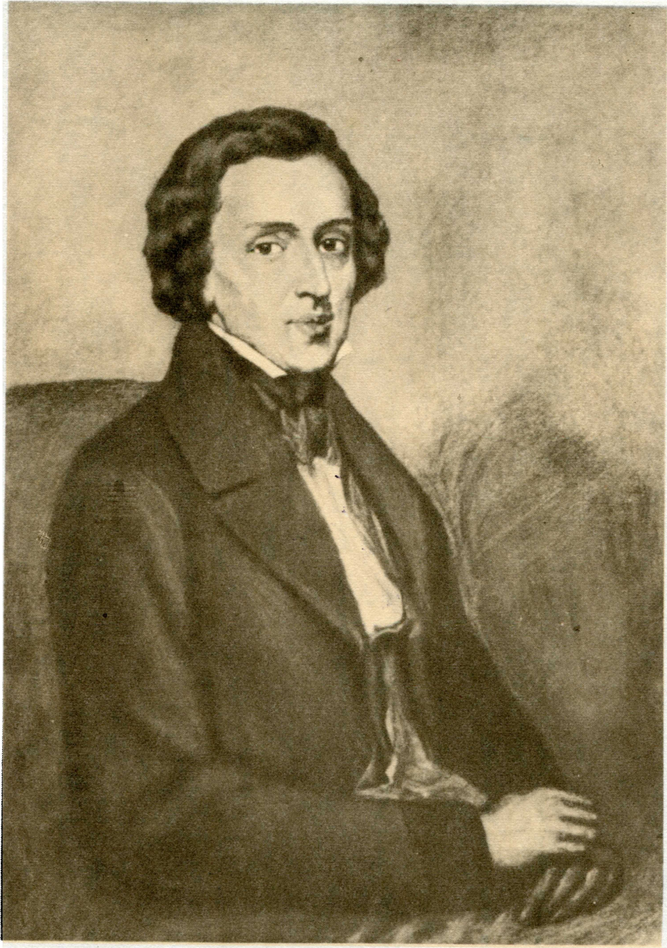
ARY SCHEFFER - OIL PORTRAIT - 1847